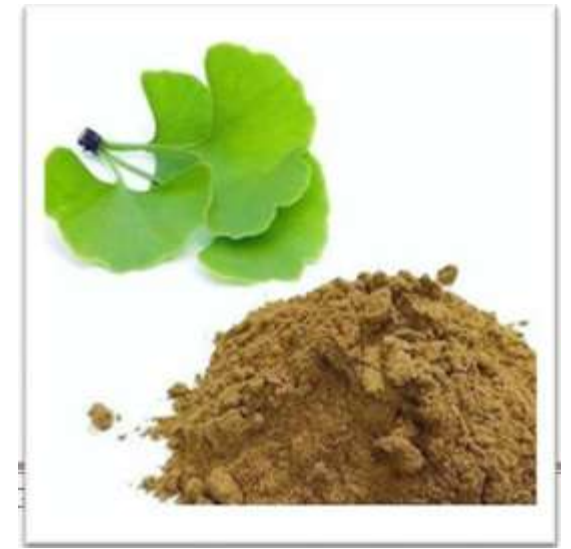
Fig no : 10 Senna Extract