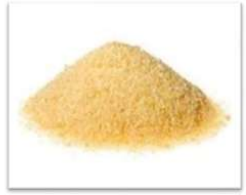
fig no :11 Gelatin