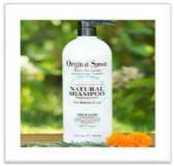
Fig no: 5 Natural shampoo