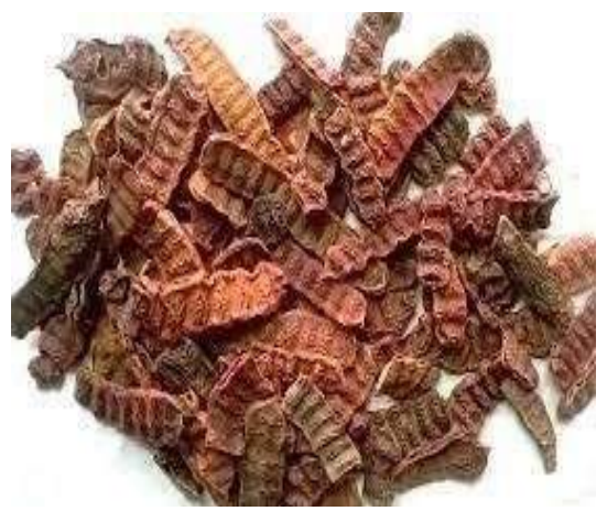
Fig no: 4 Sikakai