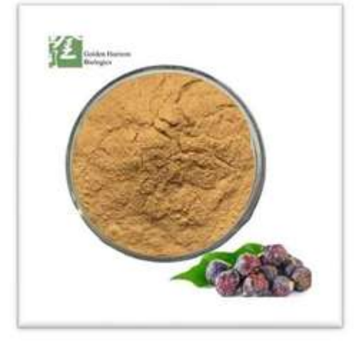
Fig no: 6 soap nut extract