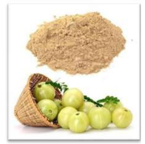
Fig no:7 Amla Extract