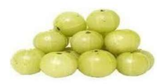
Fig: 2 Amla