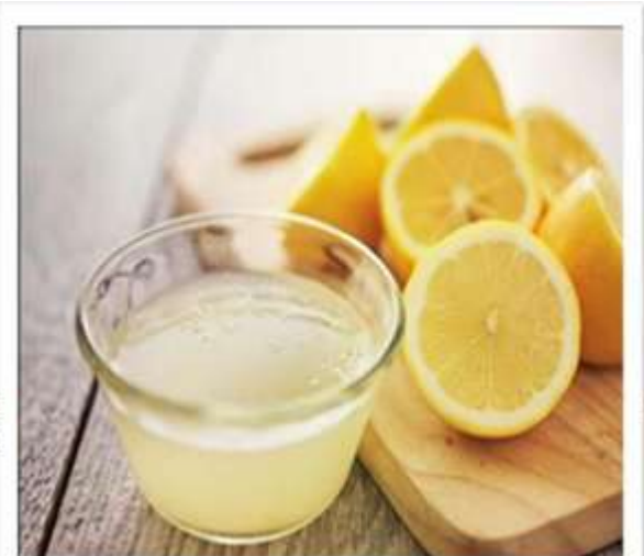
Fig no : 12 Lemon Juice