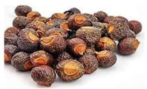
Fig no: 3RITHA