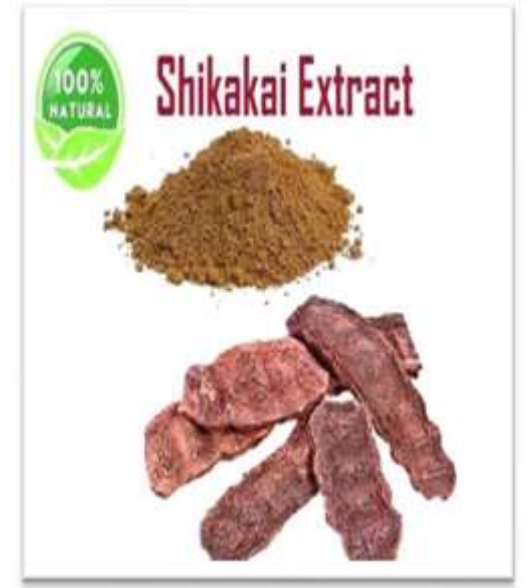
Fig no: 8 Shikakai Extract

healthy and rapid hair growth. G. Prevents Split ends.