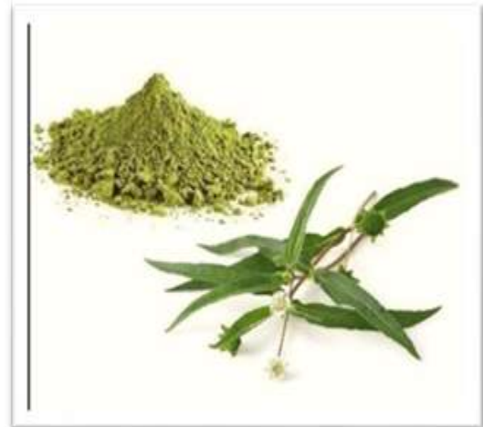
Fig no: 9 Bhringraj Extract